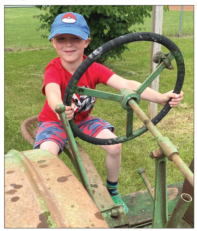
The Springfield Country Fair celebrates the community's rural roots.

Springfield will continue to celebrate the community's rural roots at the 141st annual Springfield Country Fair on July 26.